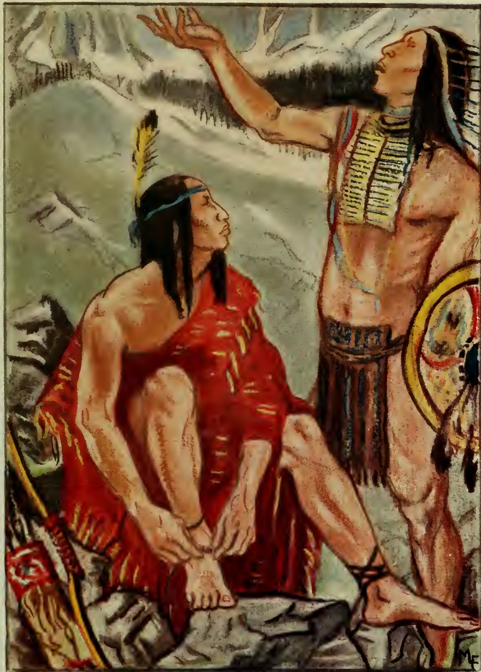
HE CAME ONE DAY UPON A MAN CLAD IN SCARLET SITTING ON THE SIDE OF A ROCKY HILL TYING STONES TO HIS FEET